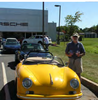
Guess who's Speedster? October 07