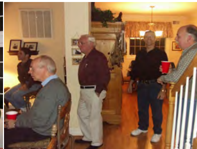
The racing movies were especially good in 2007.