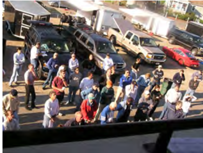
Driver's Meeting as seen from the tower Lime Rock, Sept 04