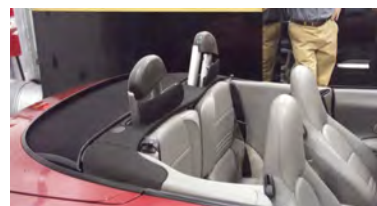
BAM! Now they are deployed!