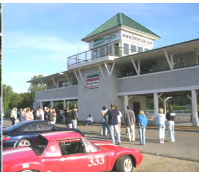
Control Tower at Lime rock from the Paddock, Sept 05