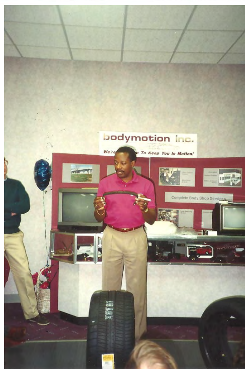
A tire rep explaining race car technology at a monthly Bodymotion meeting, May 1991