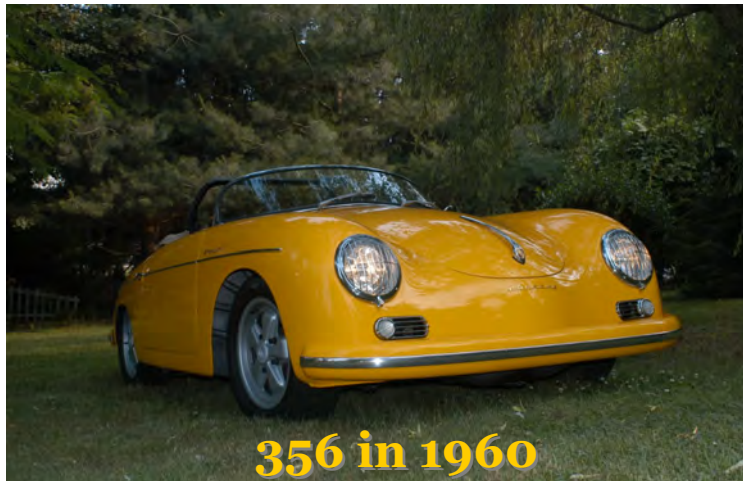
356 in 1960