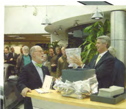
S+N New Building Dedication 2001

and a "Tech Night" at Schneider + Nelson.