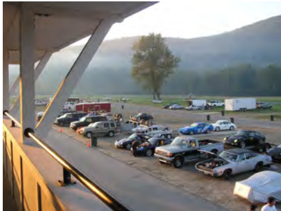
Early morning mist over Lime Rock, Sept 04

Drivers Ed at Lime Rock. We held drivers ed events at Lime rock from about 1990 through 2005. By 2006, track rental had increased to the point that Lime Rock was not affordable as a drivers ed venue. We then discontinued drivers ed events until New Jersey Motorsports Park opened in 2008. This year we held an event at NJMP and an earlier event at Pocono.