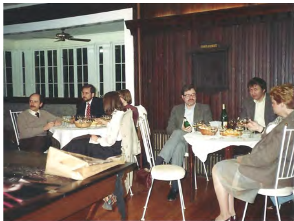
Wine Tasting, March 1988