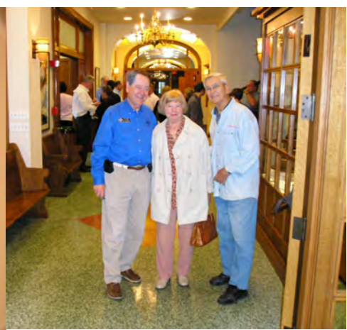
A trip to the Culinary Institute of America, Hyde Park, NY in September 2007 (above) followed by a visit to a winery (below). The club just recently made a return trip to CIA.