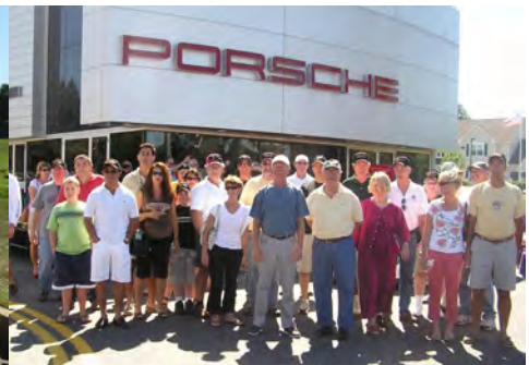
Another good turnout October 07