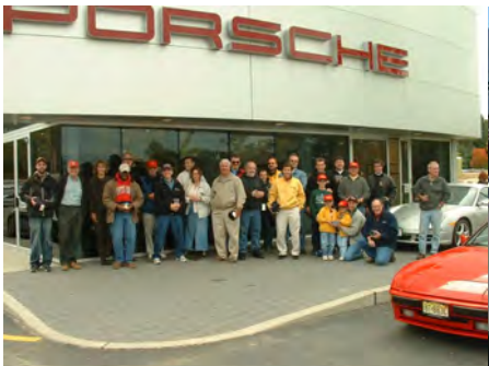
Winners Gather October 04