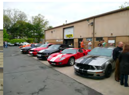
Bodymotion Cruise Night 2008

and a "Tech Night" at Schneider + Nelson.