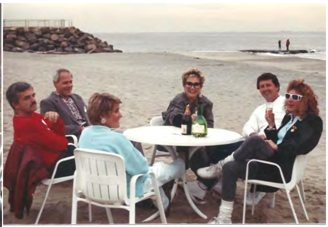
Lobster Roast at Jersey Shore. About 60 people enjoyed a gorgeous night on the beach, September 1988