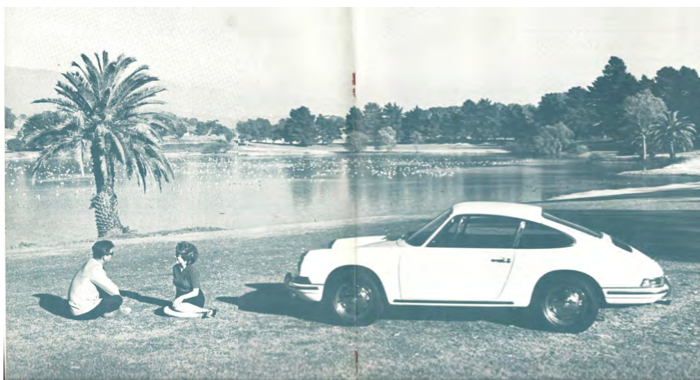
Centerfold, PORSCHE PANORAMA, February 1965 (20 pages total)