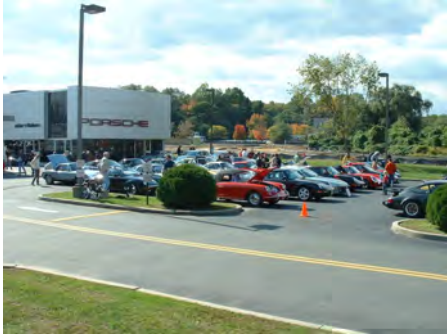
The field, October 04

For most of this decade we have held a “Unique Concours” every fall at Schneider + Nelson. As you can see, these events are well attended.