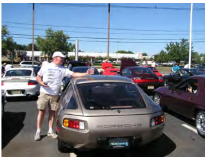
Nice to see a 928, October 07