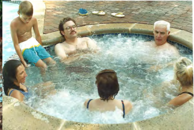
Picnic at Bavaros