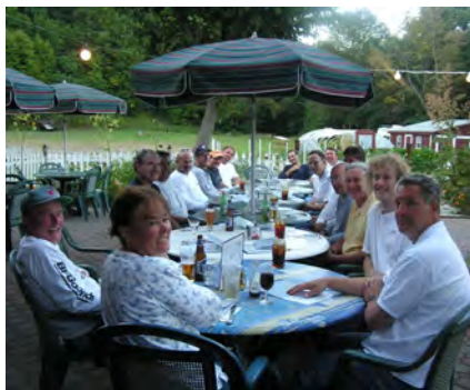
At The Brother's Pizza in Armenia NY Sept 04 after our yearly Lime Rock Event.