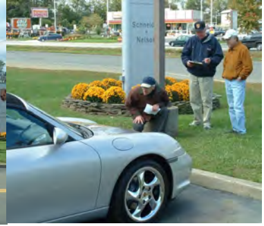
Judging, October 04