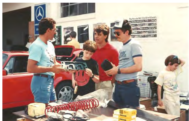
Swap Meet, June 1989