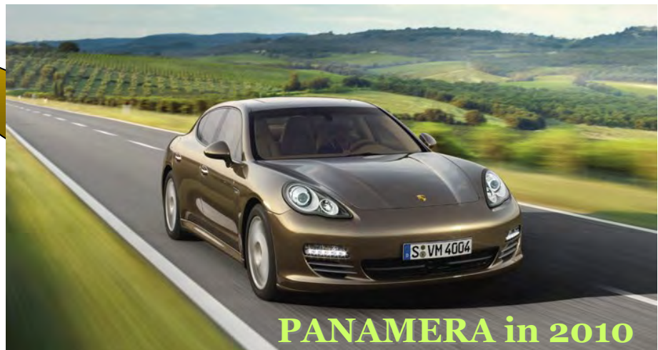
PANAMERA in 2010