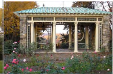
A trip to Kykuit, the Roosevelt home in Tarrytown N. Y., ovember 2005