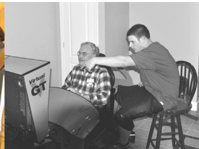
And simulated racing in 2010