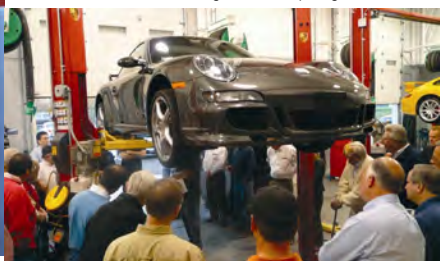
S+N Technician performs a tech inspection on a 911 Carrera S