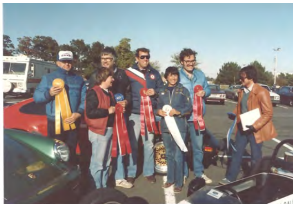
Winners, Auto Cross at EAI Inc. in Eatontown, sponsored by Shrewsbury Motors, Oct 1982