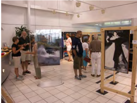
An art show in summer of 2006