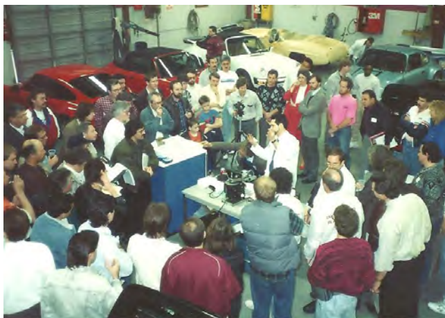
(above) Learning car technology at a monthly meeting, April 1990.