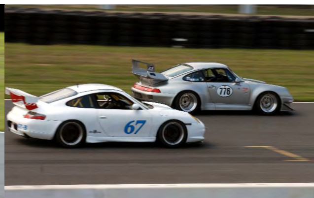
Recent Driver Education Photos from New Jersey Motorsport Park