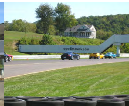
Lime rock main straight approaching Big Bend. Sept 05