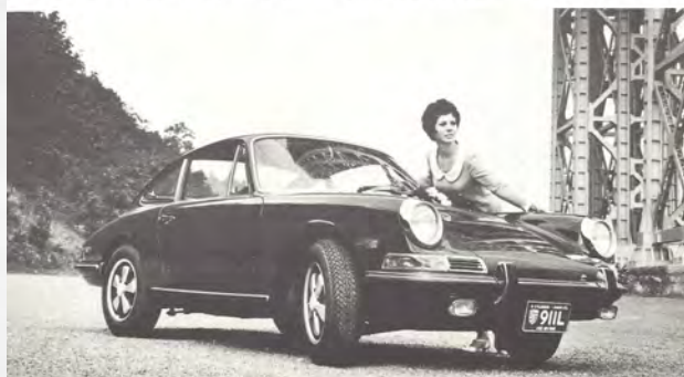
1968 911L , 912 Pano November 1967

Future plans for Jersey Shore constitute a more intense effort to bring into the Club some of the "homeless" Porsches in the area.