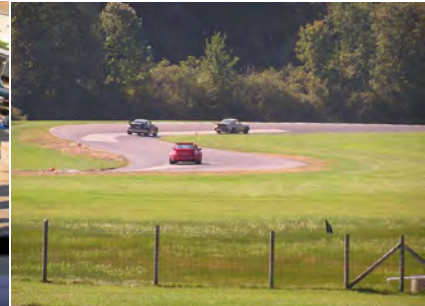
The esses at Lime Rock. A popular place to watch the action, Sept 04