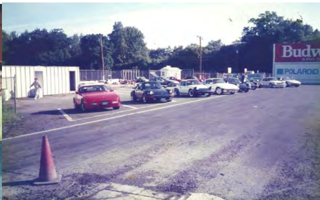
Car Control Clinic