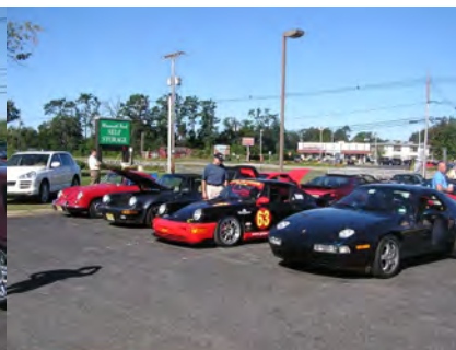
Lots of 911s, October 07